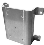
Leaf Spring & 5K Torsion