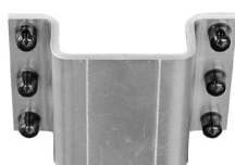
7K & 10K Torsion